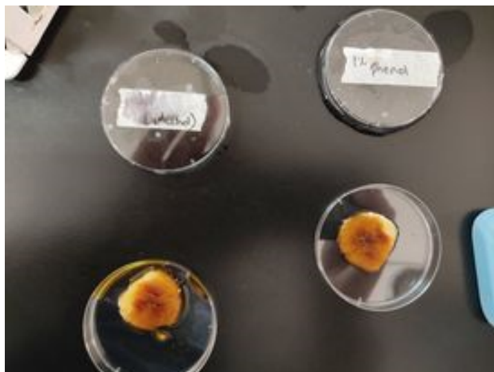
Figure 1: First Observation