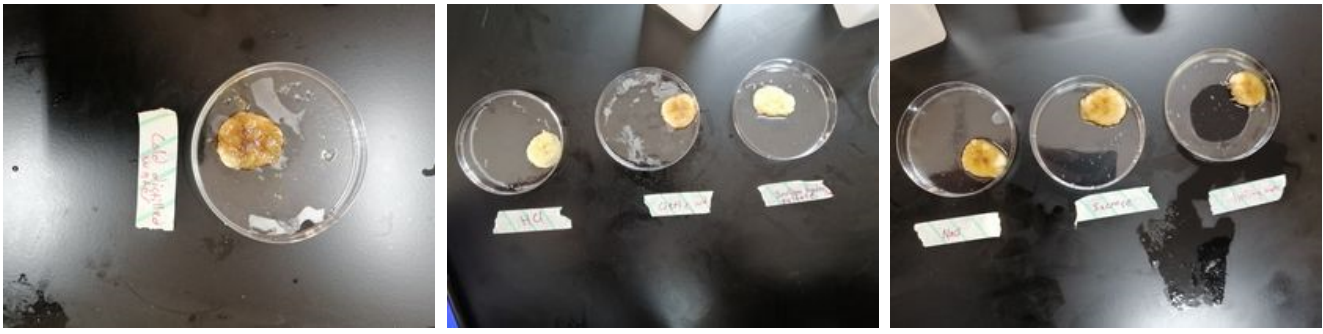
Figure 4: Fourth Observation