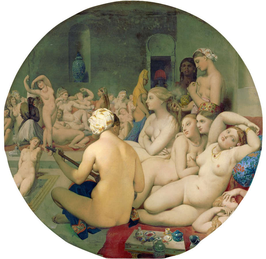
Ingres, The Turkish Bath, 1862,