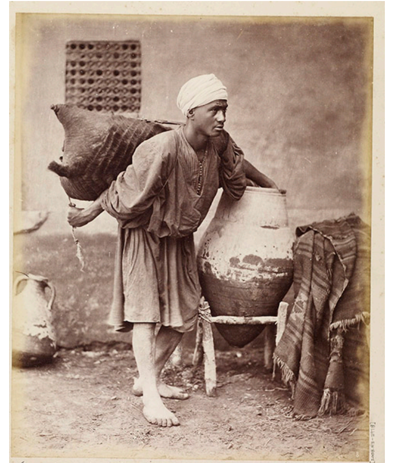
Sakkah (water carrier), Egypt, about 1872, Otto Schoefft

From about 1870 on, the photographs were normally taken outside the studio walls.