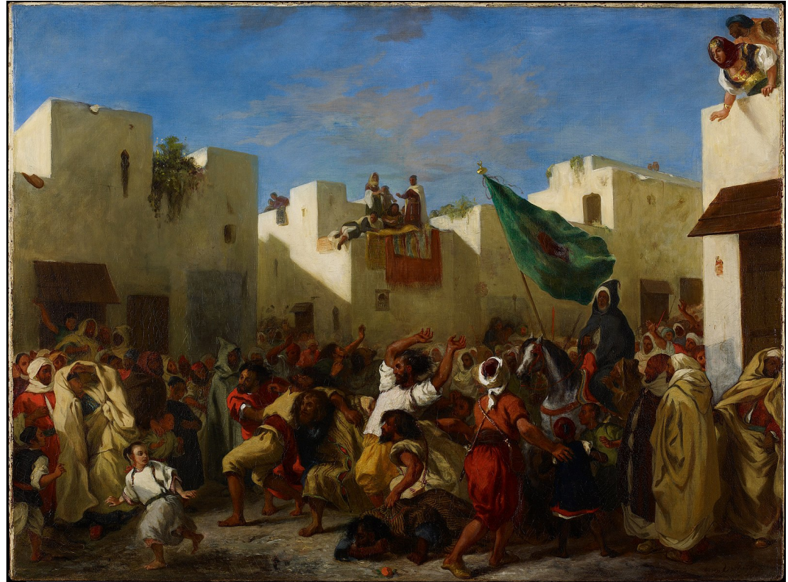
Eugène Delacroix, Convulsionists of Tangier , 1837-1838

Delacroix was fascinated by the Orient, which includes present-day Turkey, Greece, and North Africa, visiting Morocco in 1832. Yet, instead of highlighting the seductive quality of his exotic subjects, Delacroix took an avid interest in the violence and cruelty in Oriental subjects.