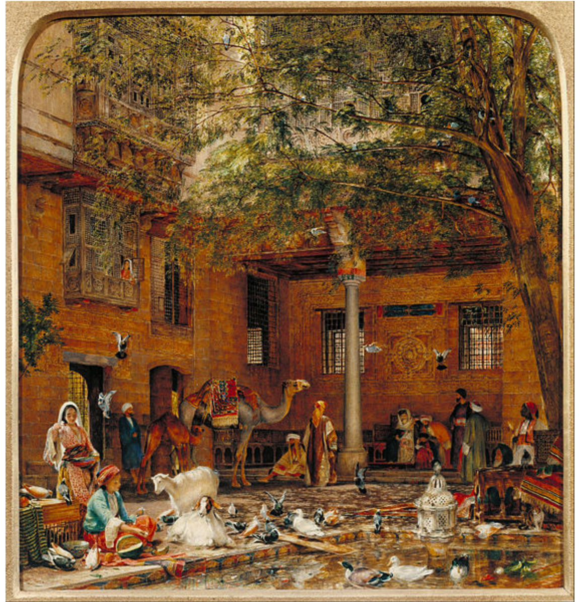
John Frederick Lewis - Study for 'The Courtyard of the Coptic Patriarch's House in Cairo' c.1864