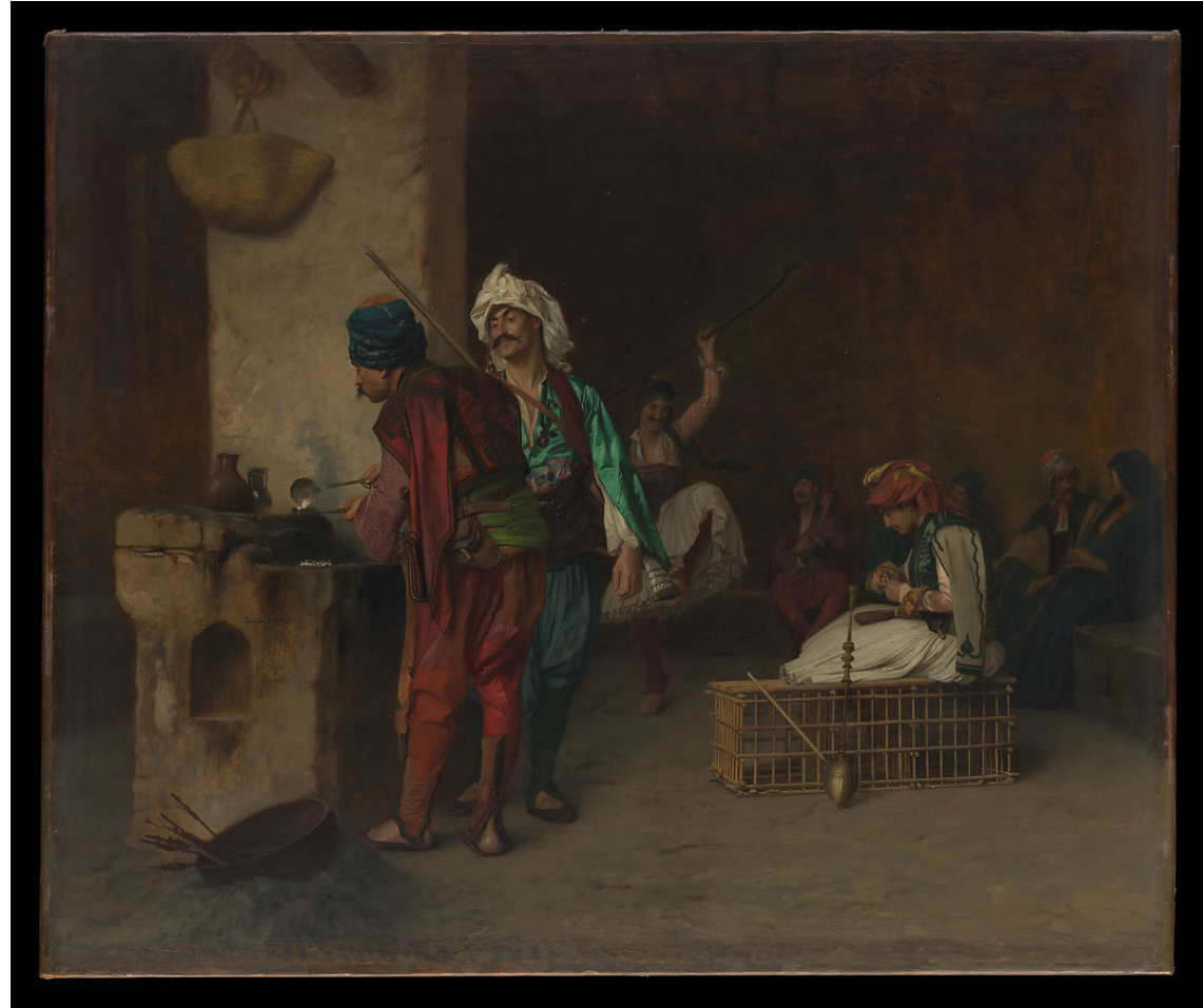
Jean-Léon Gérôme, Cafe House, Cairo (1884)