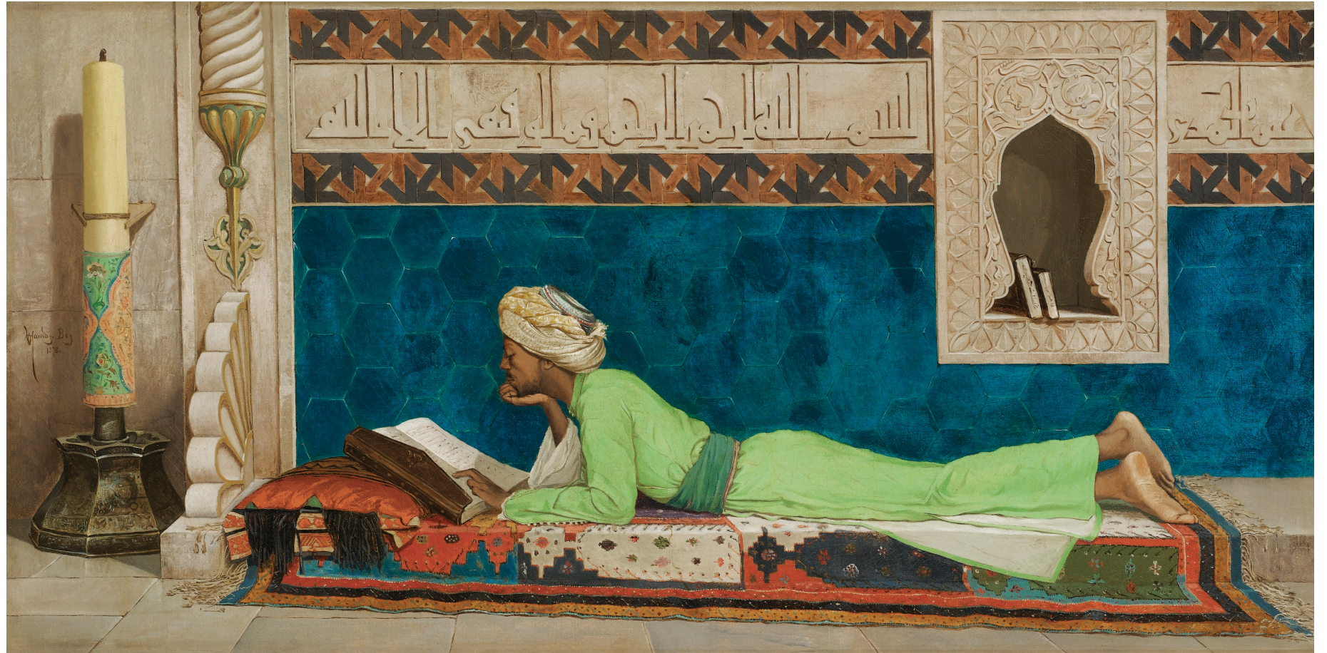
Osman Hamdi Bey, A Young Emir Studying , 1878