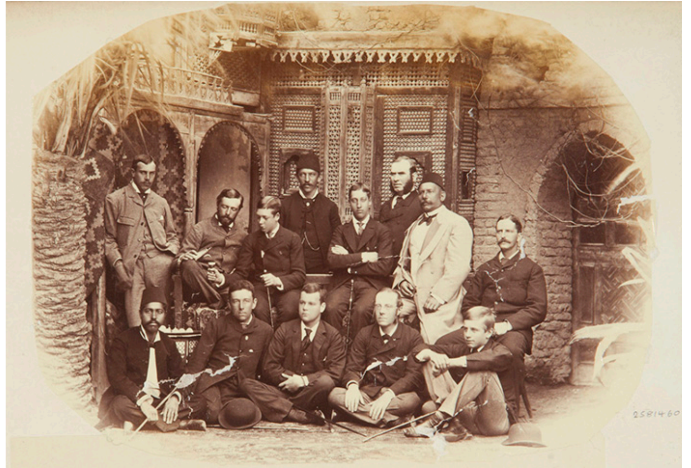
Group portrait, "the party of the Bacchante," datable to march 22, 1882,