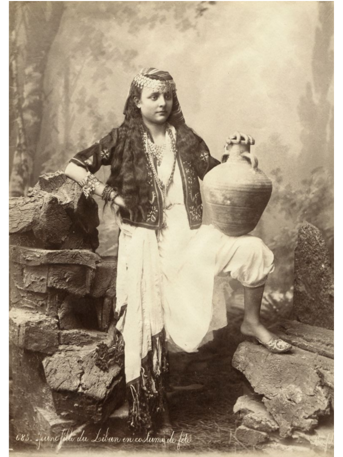
Bonfils family, Young Woman from Lebanon in Party Dress

Photographs were frequently staged and embellished to appeal to the Western imagination. The invention of photography in 1839 did little to contribute to a greater authenticity of photographic representations of the "Orient". Instead, photographs were frequently staged and embellished to appeal to the Western imagination.