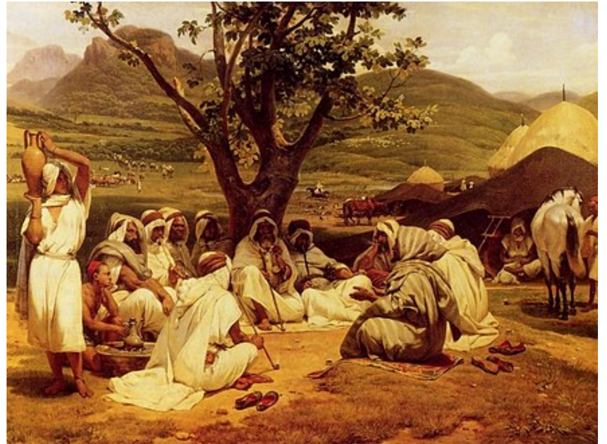
Horace Vernet, The Arab Tale Teller (1833)