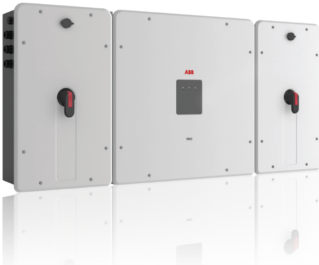
ABB string inverters TRIO-50.0-TL-OUTD-US-480 50kW

The most powerful ABB string inverter available today, the TRIO-50.0 has been designed to maximize the ROI in large systems. It has all the advantages of a decentralized configuration for both rooftop and ground-mounted installations.